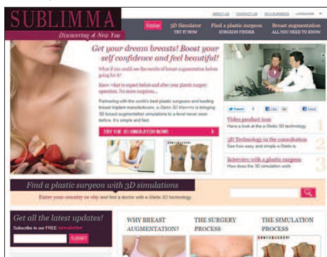
Sublimma.com: a glamorous and trendy source of information for potential patients.

With growing demand from patients seeking 3D simulations in their breast augmentation consultations, Crisalix provides a unique platform for patients to learn about this new technology and what to expect from it. Sublimma.com also provides a wealth of information on breast augmentation surgery to help patients understand some of the important choices they could be faced with when considering breast augmentation.